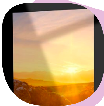
High brightness display