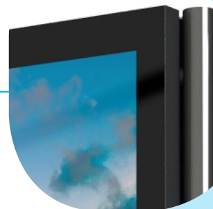
Slim design, just 232 mm deep