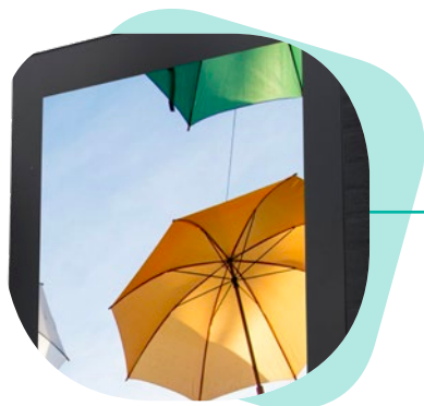
Guaranteed 90% brightness after 5 years