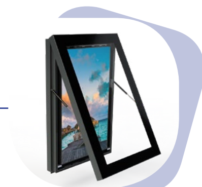
Display at both sides